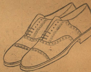
Stacy Adams Oxfords Brown or black for $10.00

Choice any black Stacy Adams Shoes in stock for ..... $9.85