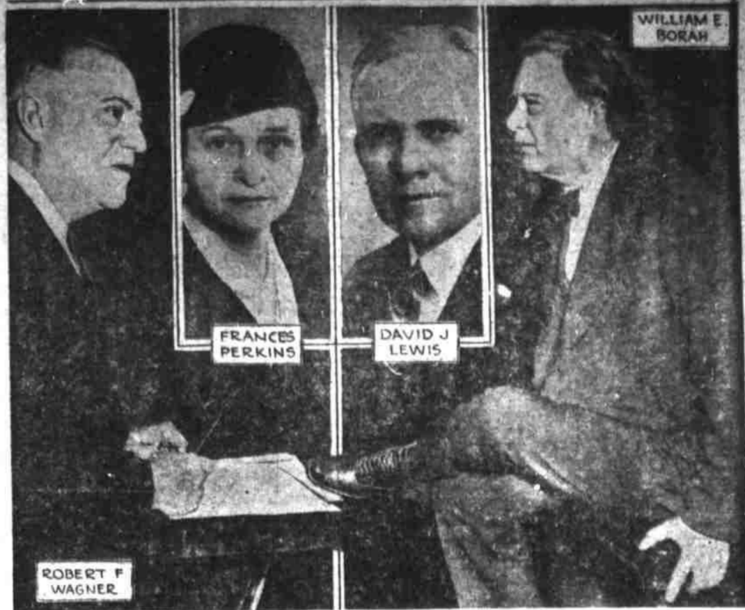
Omnibus bills providing for unemployment insurance, old age pensions, federal-state aid for mothers and dependent children, a broadened public health service and job assurance through public works were brought forward by Senator Robert F. Wagner of New York, and Representative David J. Lewis of Maryland, immediately after President Roosevelt's message on "economic security" had been sent to congress. Frances Perkins, secretary of labor, supervised the half-year study in which the program was shaped. Senator William E. Borah of Idaho, among others, criticized the program as not going far enough.