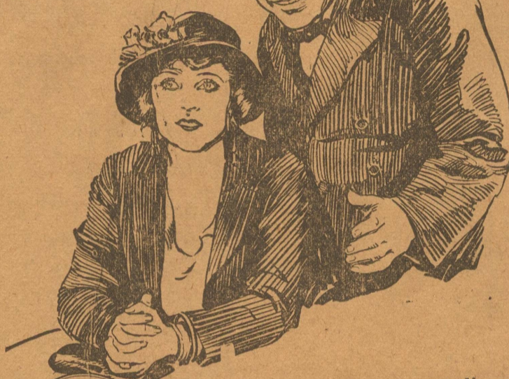
Eugene O'Neill's Pulitzer Prize Play

"You don't know the sea Anna. Tug come an' ve gat towed out on voyage—yust water all round, and sun, and fresh air to make you strong, calthy gel. Aye, it make you all clean, Anna."