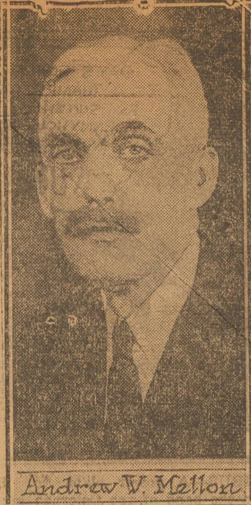
Andrew W. Mellon

President Coolidge is said to be seriously considering appointing Secretary of the Treasury Andrew W. Mellon as the American representative on the allied board that is to determine Germany's ability to pay reparations, providing French restrictions do not make American participation impossible. Secretary Mellon, a Pittsburgh millionaire, is one of the leading financial experts of the world.