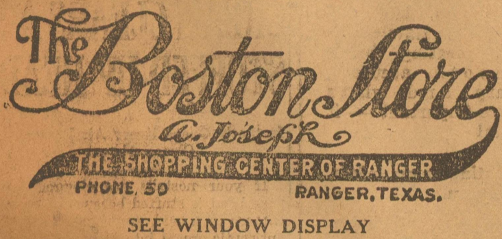
TABLE LINENS—Don't forget we are headquarters for Thanksgiving Table Linens and Napkins.

See us for real high grade, all-wool Sweaters and Sport Jackets. A complete showing of Holiday Goods. Gents' Furnishings of quality and character.