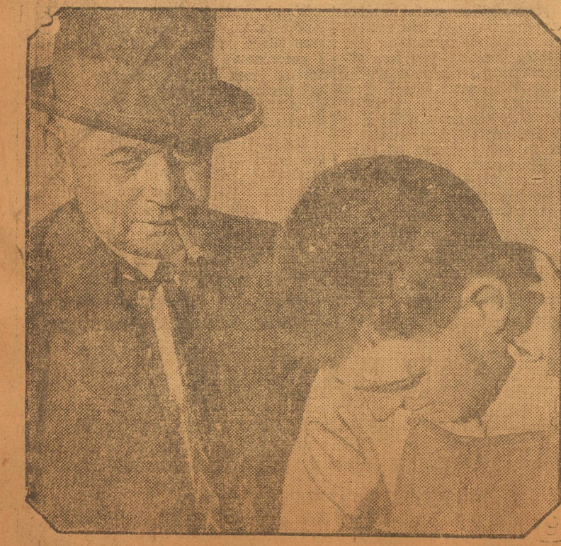
Scenes of violence have been frequent in the strike districts of Colorado. Here one of the miners, struck on the head by a mine guard at the Lester mine near Walsenburg, is shown as he tries hard to recover his senses.