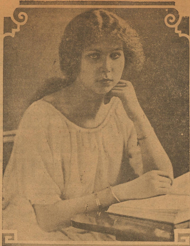
Princess Marie Jose of Belgium, who will be one of the bridesmaids at the wedding of Princess Mary, which will soon take place at Westminster Abbey, when the princess marries Viscount Lascelles, rich young peer of England.