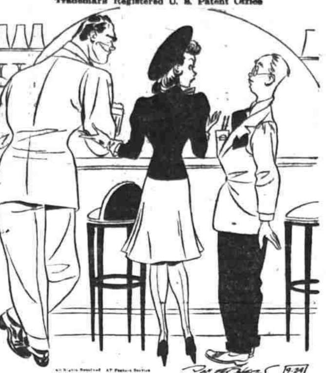
"Are you just gonna stand there and let this fella insult me?"