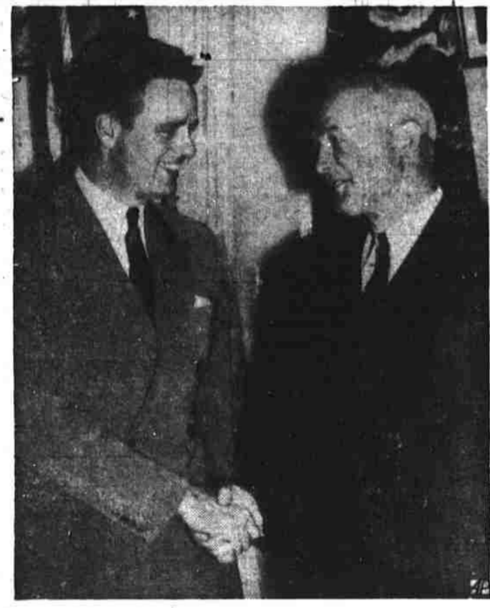
CAPTAIN IN ARMY AIR RESERVES—Elliott Roosevelt (left) of Fort Worth, second son of the president, celebrated his 30th birthday Monday by becoming a captain in the army air corps specialista reserve. Captain Roosevelt reported to Major General H. H. Arnold (right), chief of the air corps, who assigned him to duty with the procurement division at Wright Field, Ohio. Roosevelt said he would give up his private business interests to serve the army for a year.

Tokyo Forces Renew Assault On French In Indo-China