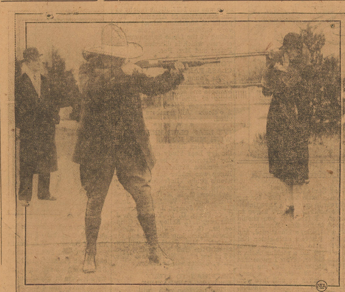
"Bang! Bang!" went Calvin's trusty shotgun, and two more clay birds bit the dust. It was at Swananoa Club, near Waynesboro, Va., that President Coolidge, prevented by a light drizzle from hunting quail, went to the traps to try his aim.