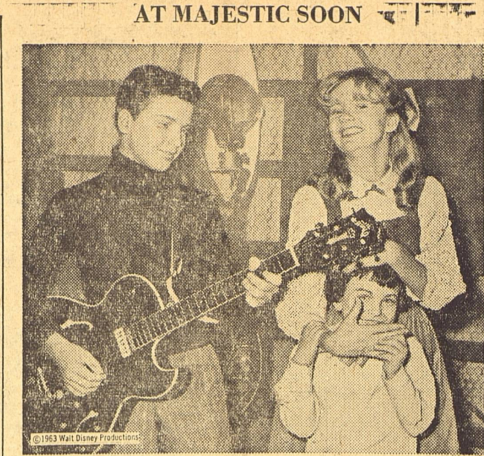
Music Makers Hayley Mills and Eddie Hodges keep things strumming Walt Disney's "Summer Magic," a color musical, which opens Wednesday at the Majestic Theater. Also starring are Burl Ives, Dorothy McGuire, Deborah Walley and Peter Brown.

One of the references from "Science and Health with Key to the Scriptures" by Mary Baker Eddy will be this: "Man is tributary to God. Spirit, and to nothing else. God's being is infinity, freedom, harmony, and boundless bliss. Where the Spirit of the Lord is, there is liberty" (P. 481).