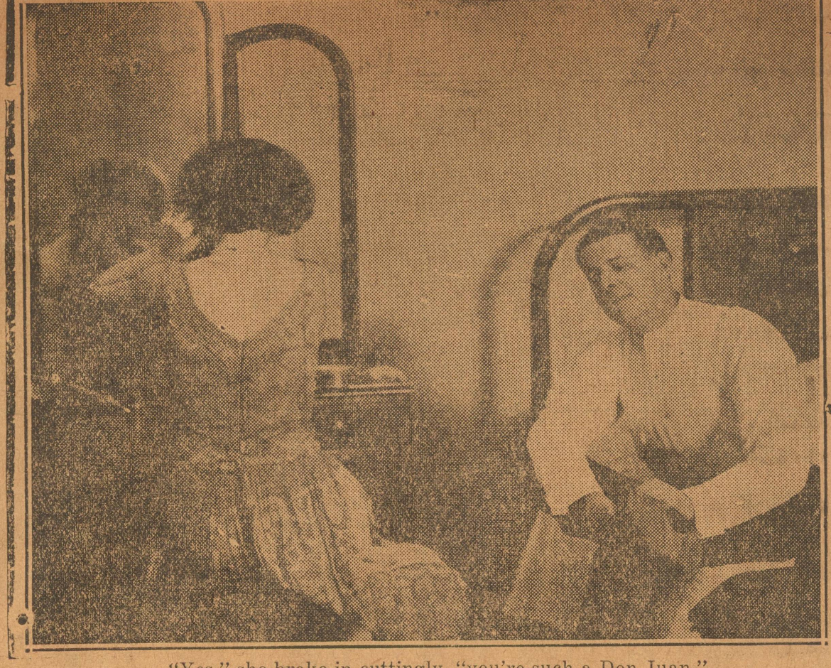
"Yes," she broke in cuttingly, "you're such a Don Juan."