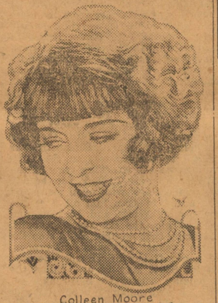
Colleen Moore "The Perfect Flapper"

lowish-white. Body appears formed like an armadillo, that is in sections, overlapping. It is difficult to decide which end is the head. Instead of a mouth the snake has just a hole at one end. The other end is without it. Natives claim this snake will snap itself together and leap through the air, and they say it is very poisonous.—I. Frederic Johnson in Adventure Magazine for July.