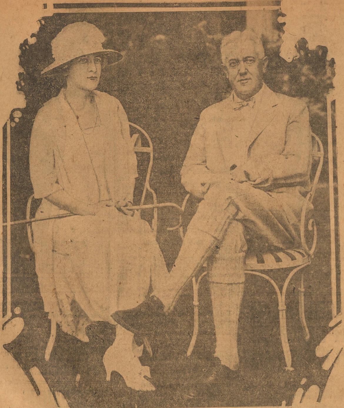
MR. & MRS. JOHN W. DAVIS. This is the latest photograph of John W. Davis, Democratic nominee for the Presidency, and Mrs. Davis, taken on the lawn of their country estate at Locust Valley, Long Island.