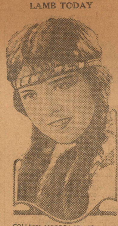
COLLEEN MOORE in 'The Hintress'