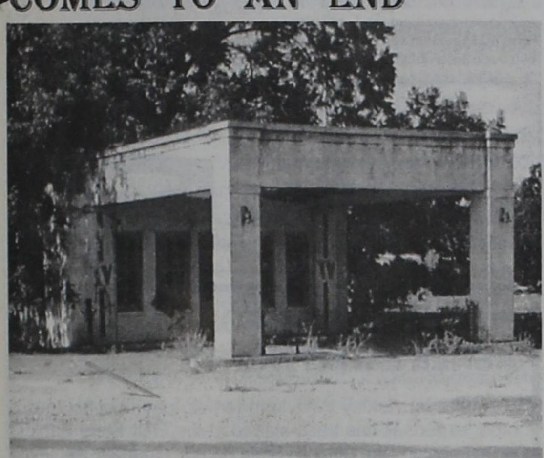
OLD LANDMARK - GULF STATION AT KENT AND ROSS STREETS Is shown before the demolation was done to the old building. The old building once housed a TV Shop.