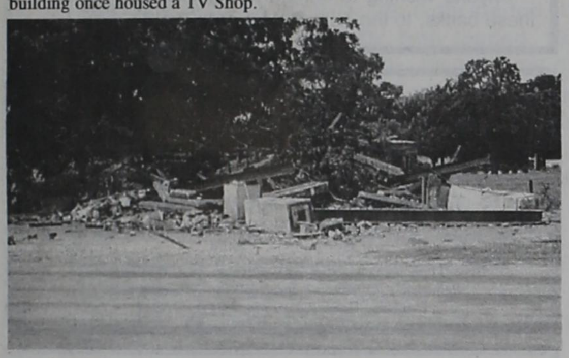
LANDMARK COMES DOWN — The old Gulf Station at the corner of Kent and Ross Streets, a landmark in Gorman, has been torn down and removed the clear the lot in preparation for the Peanut Festival activities, slated for September 10th. Plans are underway for a carnival to be placed on the empty lots where the old station, welding shop and gin once stood.