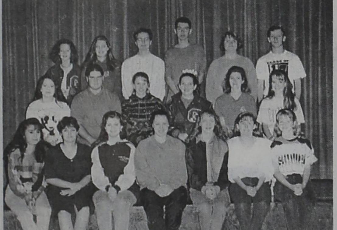
DISTRICT U.I.L. CONTESTANTS

The Gorman High School UIL contest on March 26th at Robert Lee High School. The students did well and placed in many contests. They