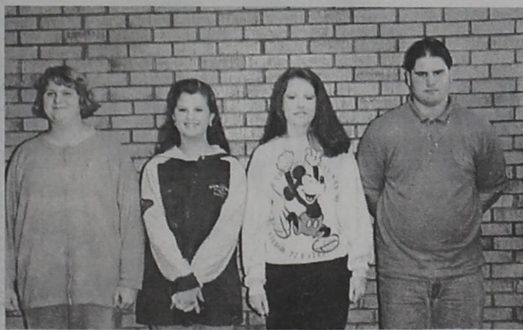
REGIONAL U.I.L. CONTESTANTS