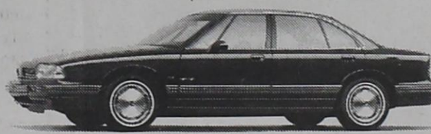
1994 Olds Delta 88 Royale

V6 Engine, Auto Trans w/Overdrive, Cruise, Tilt, P. Windows, P. Locks, Cassette, Driver Side Air Bag, Antilock Brakes, Alum. Wheels, P. Mirrors and much more. * 35 Payments of 311.51. Final Installment of 8941.40. 1500.00 Cash or Trade Down. Includes T,T,&L 8.65% APR.