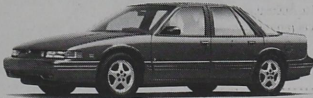
1994 Olds Cutlass Supreme

Auto Trans. w/Overdrive, Air Conditioner, Gage package, Cassette, Power Mirrors, Cruise, P. Windows, P. Locks, Tilt Wheel, Driver Side Air Bag, Antilock Brakes and much more. * 35 Payments of 272.08. Final Installment of 7647.45. 1500.00 Cash or Trade Down. Includes T,T,&L 8.65% APR.