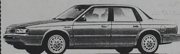
1994 Olds Ciera 4-Dr