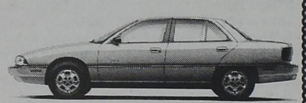
1994 Olds Achieva

Auto Trans., Tilt Wheel, P. Locks, AM/FM Stereo, Driver Side Air Bag, Antilock Brakes and much more. * 35 Payments of 263.26. Final Installment of 7097.50. 1500.00 Cash or Trade Down. Includes T,T,&L 8.65% APR.