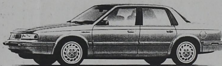
1994 Olds Ciera 4-Dr

V6 Engine, Auto w/overdrive, Cruise, Tilt, P. Windows, P. Locks, Cassette, Drive Side Air Bag, Antilock Brakes, and much more. * 35 Payments of 292.90. Final Installment of 8097.50. 1750.00 Cash or Trade Down. Includes T,T,&L 8.65% APR.