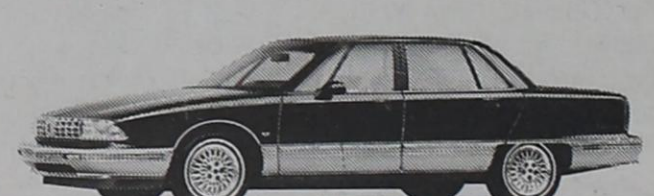
1994 Olds 98 Regency 4-Dr

* 35 Payments of 335.75. Final Installment of 10,597.35. 2500 Cash or Trade Down. Includes T,T,&L 8.65% APR.