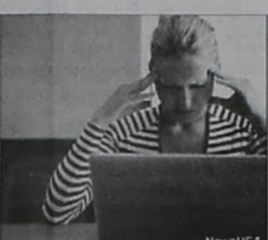
Plagued by computer prob-lems? Geeks on Call offers instantaneous support.

If a person's computer suddenly crashes, slows down or gets a virus, Geeks On Call is there with comprehensive technical support to see the issues through