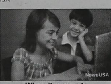
When it comes to technology and kids, finding a balance is key.

only when you're present. Set site limits. Discuss the sites your children want to visit, and dis-