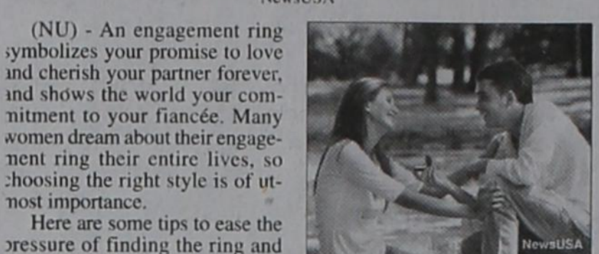
Choosing the right engagement ring can help make your big moment memorable.

with classic style will want a different band design than a trend-set-