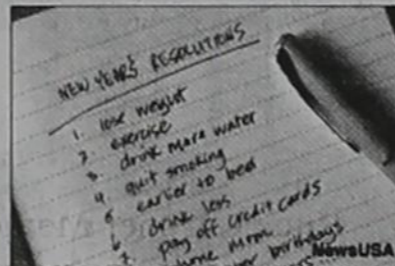
Take a look at the top 12 doctor-prescribed New Year's resolutions before you finish your list.

The most surprising: Don't give up coffee. Yes, that's correct. Coffee actually has health benefits that doctors recommend. Studies show that women who drink a cup of coffee daily have up to a 25 percent lower stroke risk than those who drink it less often. In addition to lowering stroke risk, coffee can also decrease your odds of developing