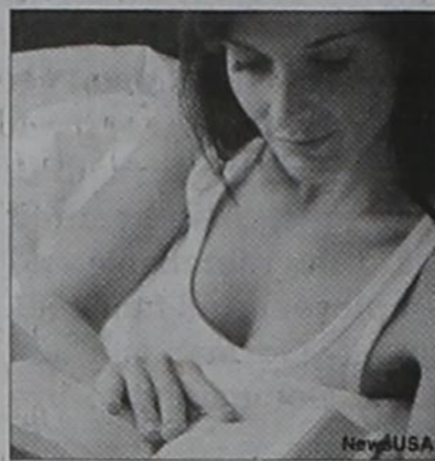
Unwinding with a book or relaxing music before bed may help you fall asleep.

If you've ruled out an underlying sleep disorder, like sleep apnea, but still find yourself counting sheep, try the following tips: