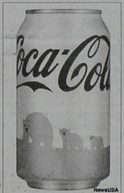
To help start a buzz about polar bear conservation efforts, Coca-Cola is turning its blazing red cans to arctic white.

You can explore your parcel, take part in video chats with WWF scientists and track virtual polar bear sightings. • Visit ArcticHome.com to experience and learn more about the polar bear and its habitat.