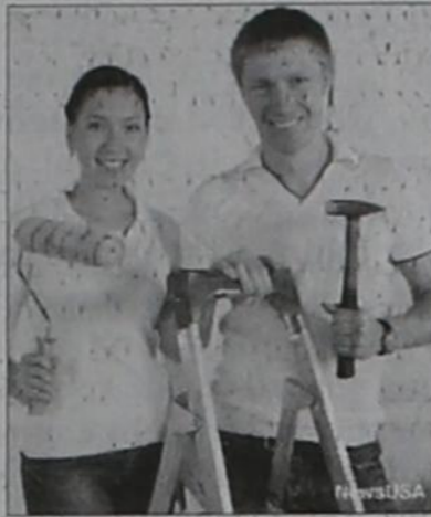
Having the right tool for the job is key for any DIYer.

• NEXTEC G2 Drill/Driver. Boasts the best torque in its class,