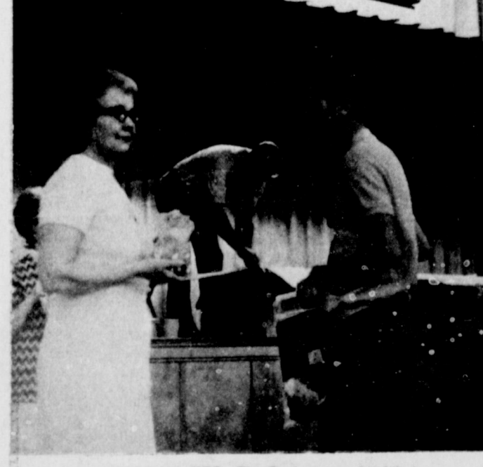
GRADUATION APPROACHES...The Seniors received their caps and gowns on Monday, May 1, in preparation for 1972 graduation exercises.

The easiest way to finish a hard job is to get to work.