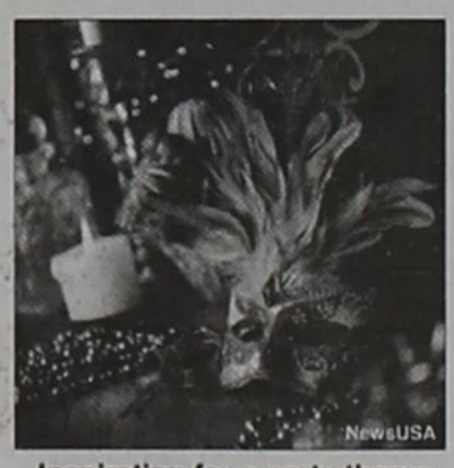
Inspiration for a party theme can come from anywhere masquerades, Jersey Shore, clothing - but these tips will get you thinking.

Tap into doomsday fears. Optimize on the end-of-the-world hype and throw a wicked bash with a Goth theme. Keep an upbeat mood with punk rock favorites from the "Night of the Demons"