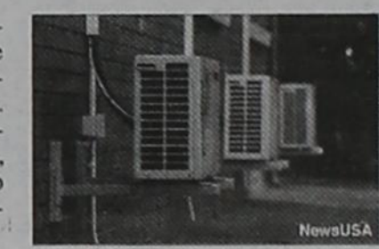
Energy-efficient HVAC systems can save you money with purchase rebates on top of monthly savings on utility bills.

The experts at Carrier suggest that those planning to install energy-efficient technologies talk to a local contractor about potential HVAC purchases and take a look at www.energy.gov/taxbreaks.htm