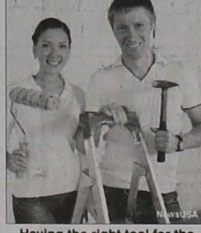
Having the right tool for the job is key for any DIYer.

NEXTEC G2 Drill/Driver. Boasts the best torque in its class,