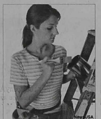
Remodeling is a great time to think about energy-saving solutions for your home.

Though investing in energy-efficient heating and cooling may have the biggest impact on reducing household energy use, homeowners should approach energy ef-