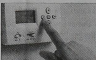
Turning the temperature up or down won't save you money or energy, so learn how to fully utilize your thermostat.

it. According to the Environmental Protection Agency (EPA), energy can be saved if you keep energy-saving set points activated for longer timeframes. So, you could leave home energy-saving set points on during the work/school day, or at night when family members are asleep, for instance.