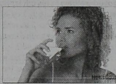
Drinking water goes through an extensive cleaning process before it arrives at your tap.

Drinking water utilities are committed to protecting public health and constantly monitoring and reassessing their methods for treating water to ensure its quality. In part, this is due to changing government regulations, which periodically alter water quality standards. In addition, they may undertake other forms of treatment