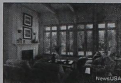
Increase efficiency, style and comfort with one long-lasting home improvement project - window replacement.

Outdoor Spaces According to a survey by the American Institute of Architects,