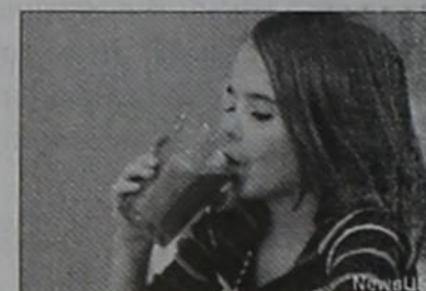
Chocolate milk offers similar nutritional value as regular milk.

Many nutrition and health organizations - including the American Heart Association, the American Academy of Pediatrics, the American Dietetic Association and the School Nutrition Association - agree that flavored milk is