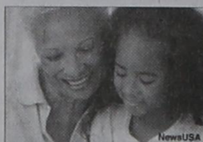
Don't let hearing loss affect time with the grandkids.

The NIDCD reports that only one out of every five people who