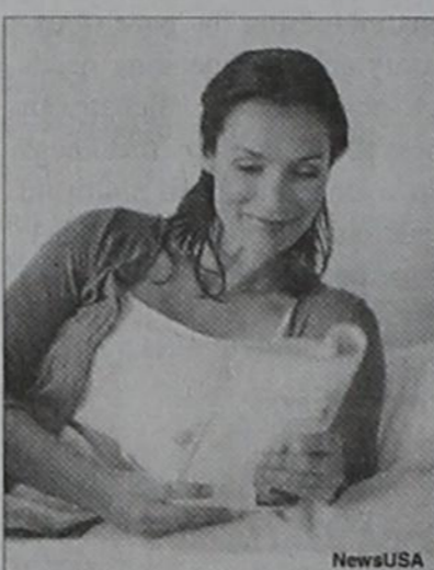
Moms, sit and relax while easing your mind with a good book.

• Watching kids read can remind moms how relaxing it is to escape in the pages of a riveting novel. Get mom-friends together and form a book club, so there's always an excuse to take a break. Tell kids you're doing Mommy-homework, because the book club is meeting soon. • As the sun sets, parents want