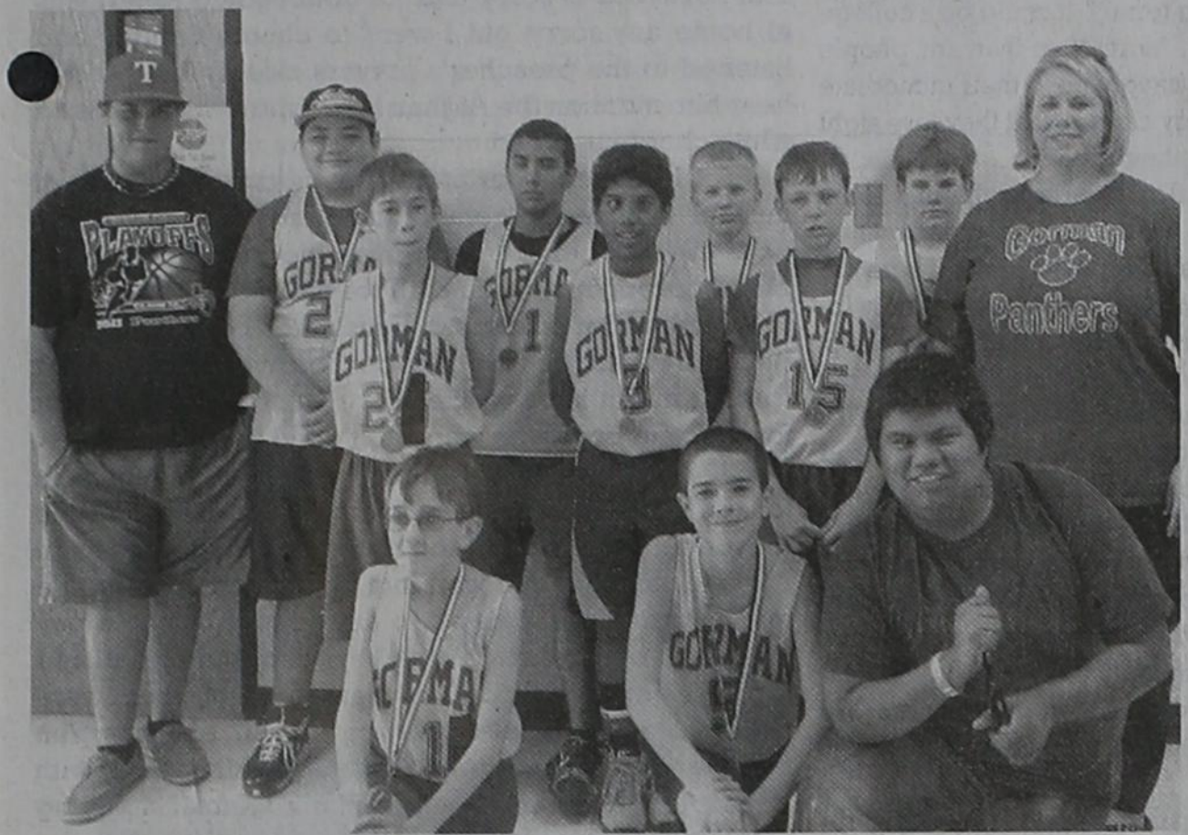
Gorman Youth league boys (5th/6th) won 1st place in the Junior Class tournament this past week. Congratulations to all of the boys.