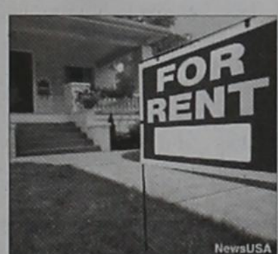
The economy is forcing many real estate investors to rent out unsold homes.

· Find quality tenants. Nightmare tenants can be, well, a nightmare. Prepare for a careful