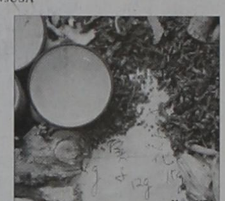
More Americans are turning to herbs, not drugs, to address health issues.

Luckily, patients don't need to travel cross-continent to find these