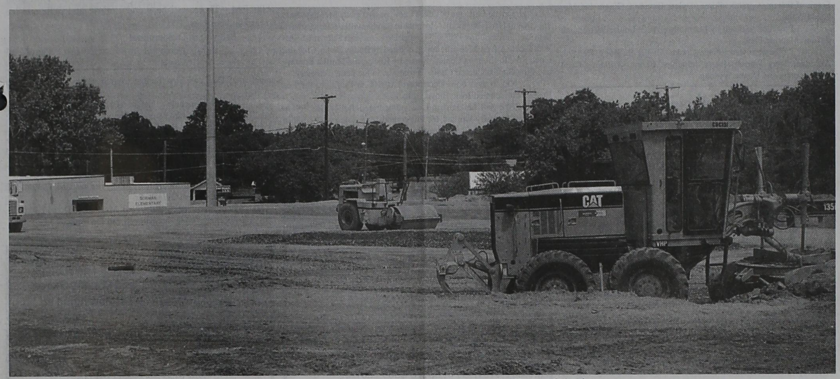
Land work continues on the new gym and classrooms for Gorman Schools.