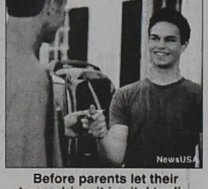
teens drive, it is vital to discuss the importance of vehicle maintenance.

lows the oil level to fall too low, the result can be overheating and low oil pressure that can lead to increased wear and even catastrophic engine failure.