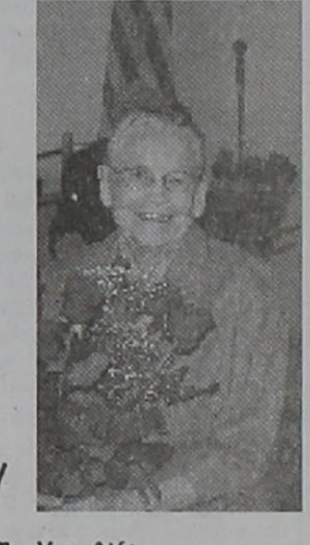
Your Presence Will Be Your Gift.

Gorman Housing Authority (Hotel) Social Room