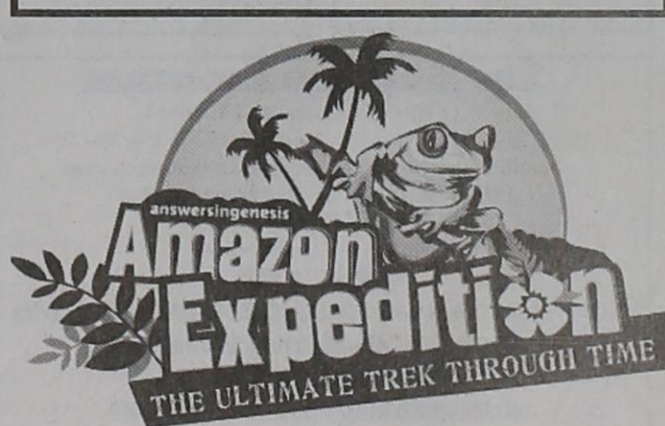
VBS!! July 14 thu 18 - 6:30 - 8:30 p.m. New Hope Baptist Church

The Gorman High School cheerleaders have some remaining flip flops for sale. Sizes range from child size 11 to adult size 12. Quantities are extremely limited, please call Becky Swanner at 734-2480 or contact any cheerleader if interested in buying some Panther flip flops.