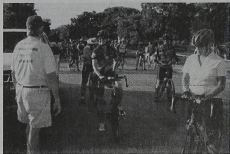
Riders at the Start Area