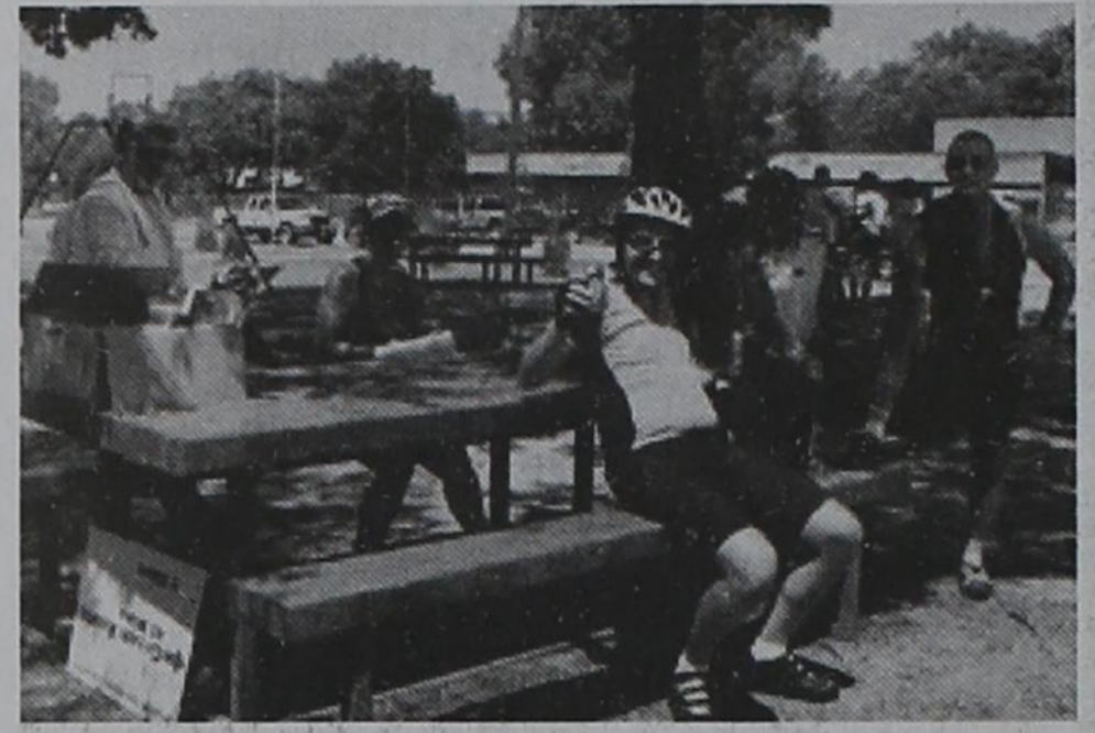
Riders enjoy ice cold Dublin Dr. Pepper after the race