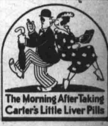
The Morning After Taking Carter's Little Liver Pills

Cellar-dwelling Jacksonville broke its losing streak in the East Texas League race with an 8-3 win over second-place Texarkana Sunday while Longview was completing, 6-4, a sweep of a series with league leading Henderson.