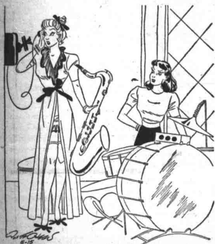
"What's the matter with those people downstairs? Don't they like music?"

Trademark Registered U. S. Patent Office