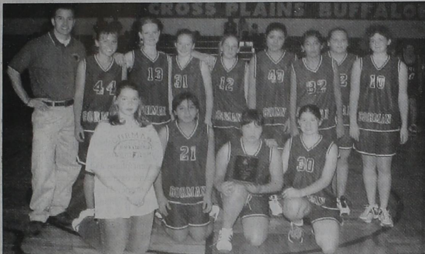
Gorman Junior High Girls—First Place at Cross Plains Tournament