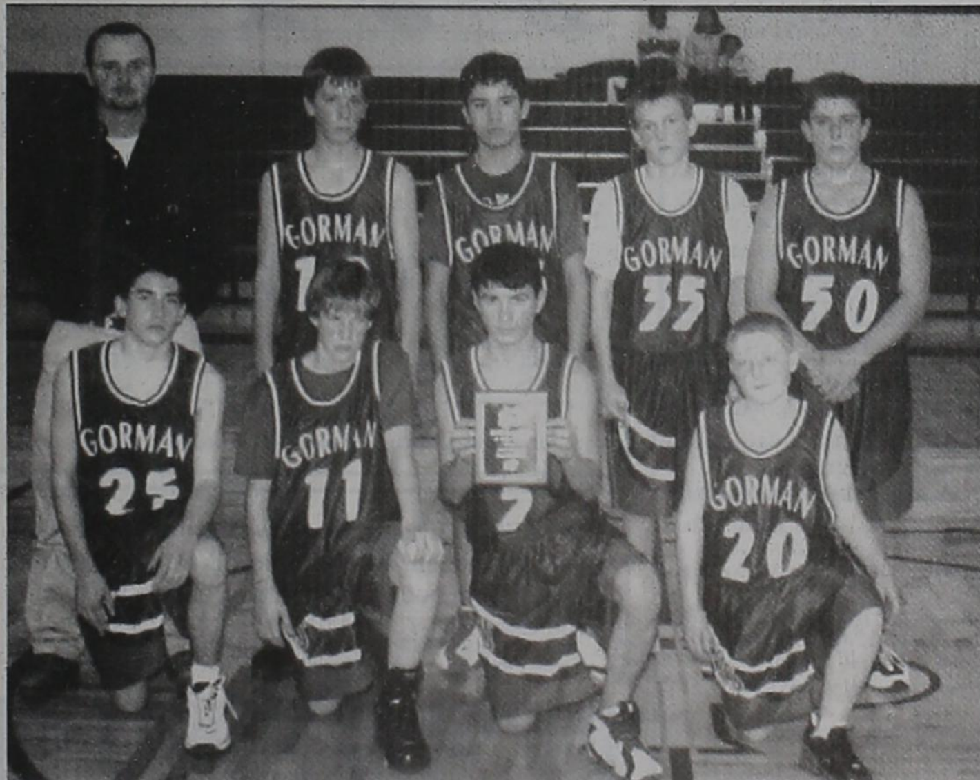
8th Grade Boys take 2nd place at Cross Plains Tournament

8th Grade vs Evant—Gillen-8, Underwood-2, Swanner-11, Vann-3