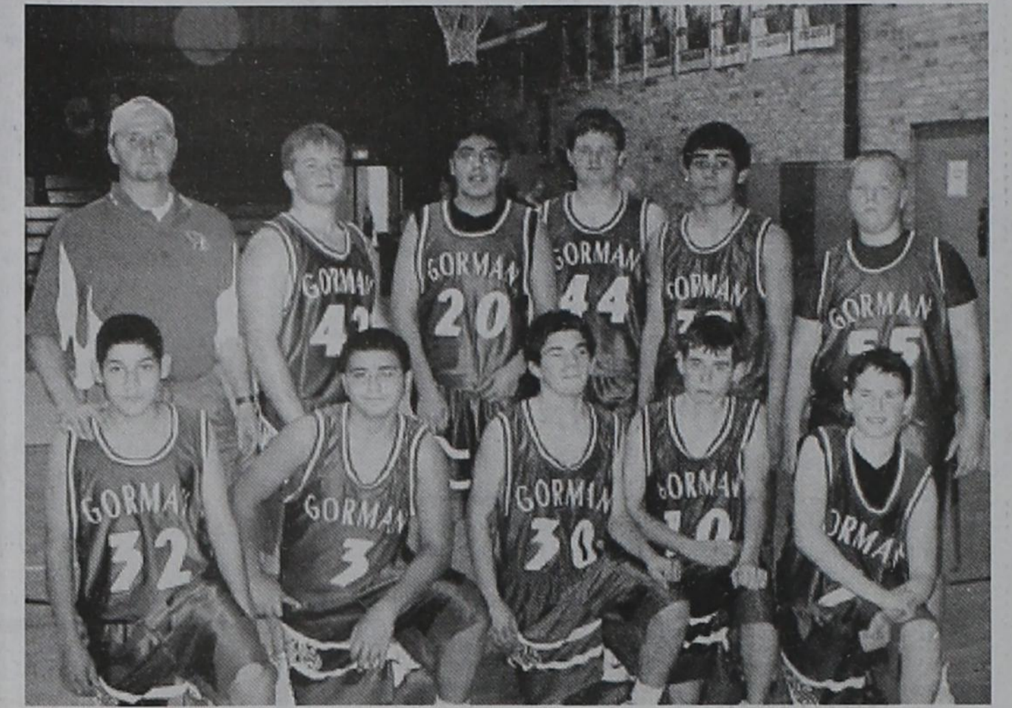
Congratulations to the Gorman Cubs 8th and 7th grade basketball teams. Each team just completed a very successful season. The 8th grade completed their district schedule undefeated with a perfect record of 10-0. The 7th grade finish 7-3 and a second place finish in the district. These young men worked very hard all season long. Good job and keep up the good work. Coaching Staff