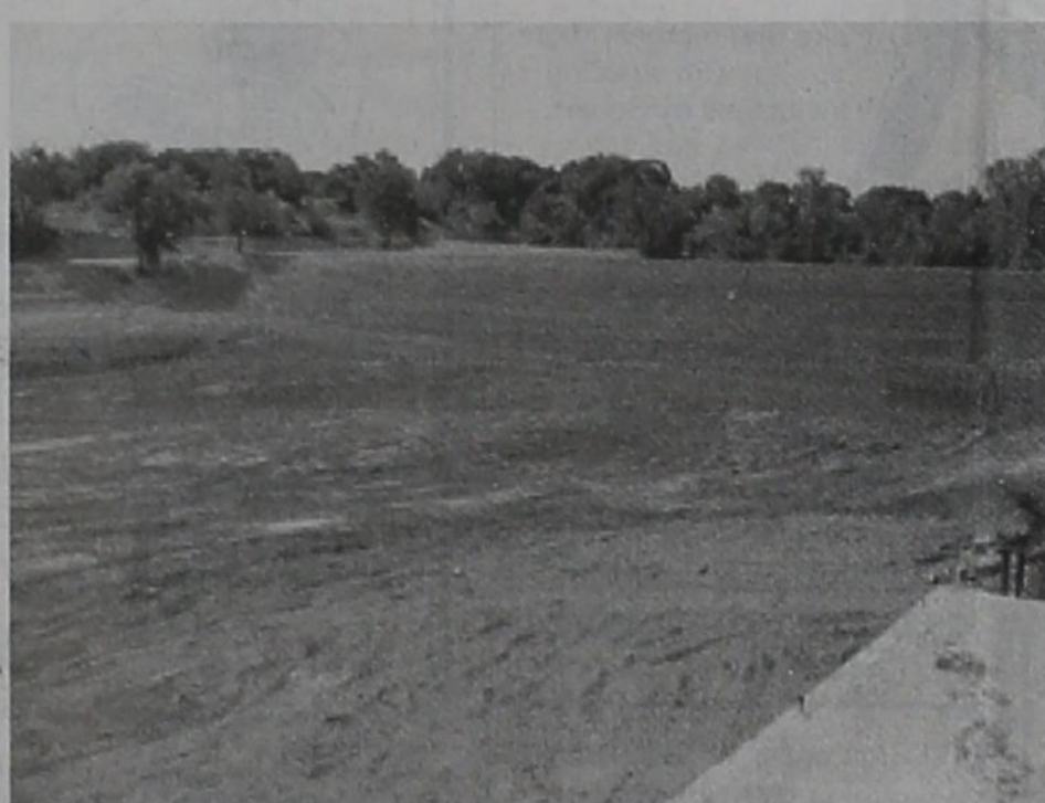
Work on Club Lake Dam completed