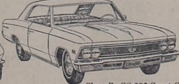
Chevelle SS 396 Sport Coupe

All kinds of cars, all in one place... at your Chevrolet dealer's Chevrolet · Chevelle · Chevy II · Corvair · Corvette