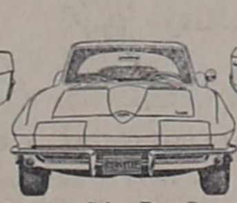
Corvette Sting Ray Coupe