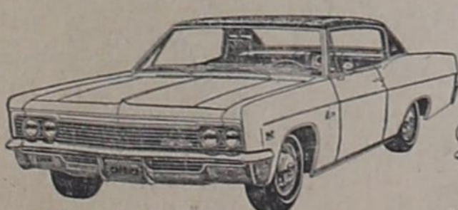
Caprice Custom Coupe

We offer two Turbo-Jet 396 V8s for '66. You can order 325 hp in any Chevrolet; 325 or 360 hp in a Chevelle SS 396. There's also a 427-cu.-in. Turbo-Jet (up to 425 hp) available in Chevrolets and Corvettes.