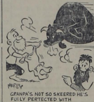
GRANPA'S NOT SO SKEERED HE'S FULLY PERFECTED WITH