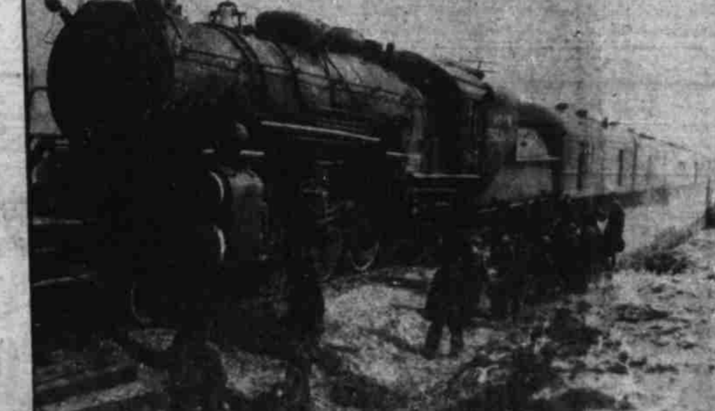
Drifting dust, heaping on the right-of-way, derailed this Rock Island passenger train near Colby, Kas., following one of the worst "blows" of the spring.