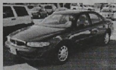
'03 Buick Century Stock #5202 Very Low Miles $15,995.00 +T,T&L