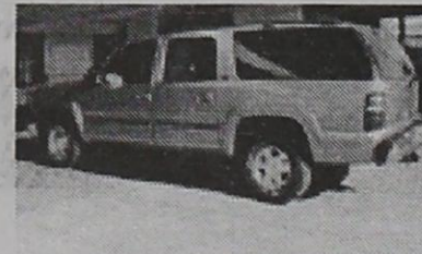
'01 GMC Yukon XL Stock #5202 SLT - 4X4 - Leather $26,995.00 +T,T&L