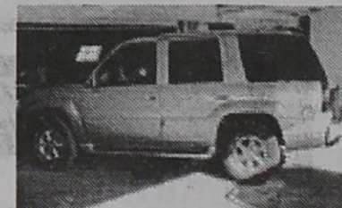
'00 Cadillac Escalade Stock #5331B Very Nice - 1 Owner $24,995.00 +T,T&L