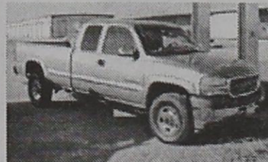
'01 GMC 2500 X-Cab Stock #5150B 4X4 - Nice Truck - PWL $19,995.00 +T,T&L