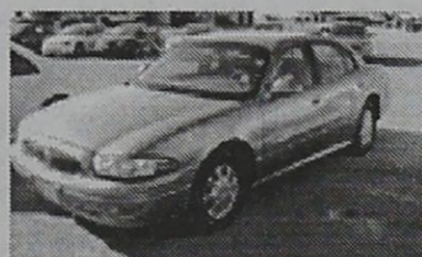
'03 Buick Le Sabre Stock #5340 PWL - CD $19,995.00 +T,T&L