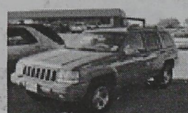
'98 Jeep Gr. Cherokee Stock #5311 PWL - 2 Wheel Drive $9,250.00 +T,T&L