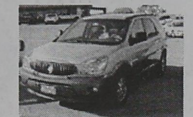
'02 Buick Rendevous Stock #5252 One Owner PWLS - CD $18,950.00 +T,T&L