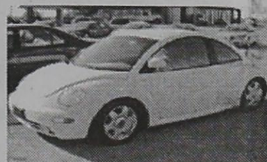
'99 Volkswagon $11,495.00 +T,T&L