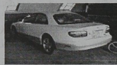
'00 Mazda Millenia Stock #5266B S-Class - Leather - Moonroof - Loaded - Very Nice Car $13,995.00 +T,T&L