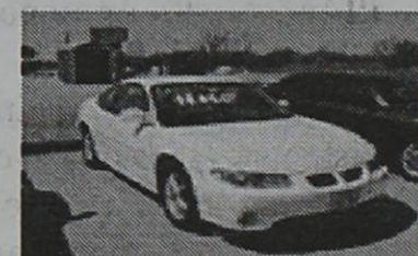
'99 Pontiac Gr. Prix GT Stock #5303 $9,995.00 +T,T&L