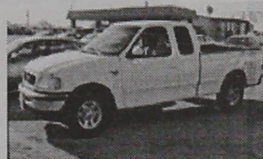
'98 Ford F-150 Stock #5216D $8,995.00 +T,T&L