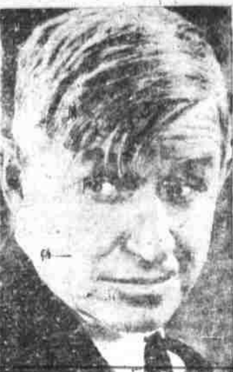
Your old friend Will Rogers appears as a country editor who solves his neighbors' problems in "Life Begins at 40," one of his comedy successes which is playing at the Lyric now.