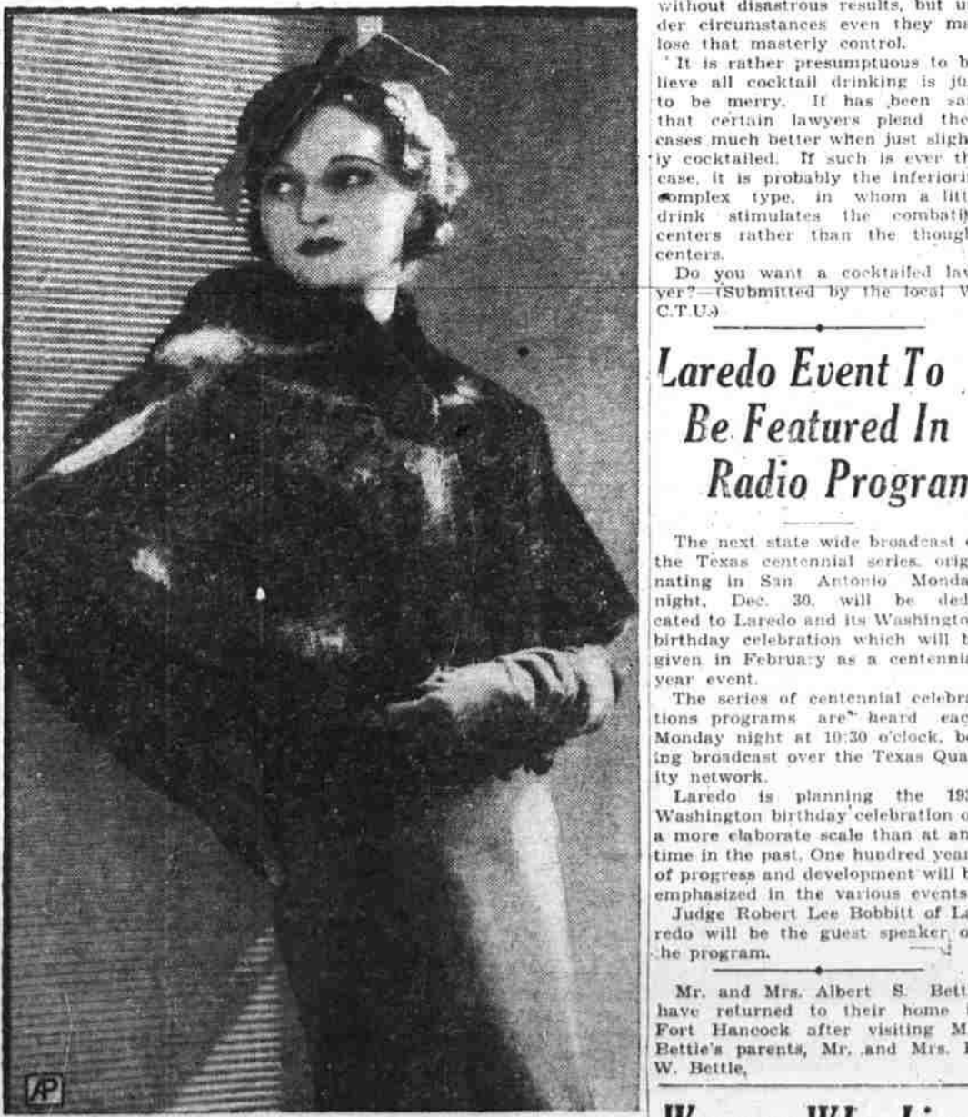
Well toward the top of fashion's winter list of preferred styles this season is the fur cape. Philippe et Gaston put this waistlength model of brown seal, fastened with a seal button, over a simple brown wool frock.

ADVANCE—NOT RETREAT COCKTAILED LAWYERS A cocktailed attorney said, "Shure, I don' wanna cocktailed doctor. I wanna doctor this sober."