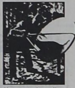
The amazingly small PRIMESTAR dish (about 3 feet in diameter) and receiver do it all.

De Leon Office - 893-6110 / Eastland Office - 629-1580