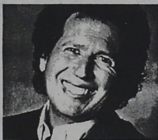
HBO brings you the award-winning THE LARRY SANDERS SHOW starring Garry Shandling.