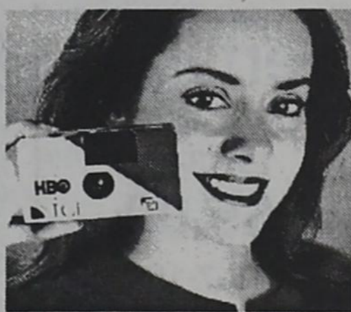
FREE Fuji Quicksnap Camera!