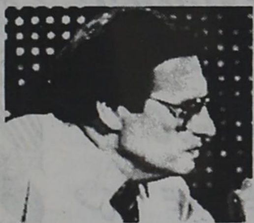
LARRY KING interviews top newsmakers every weeknight on CNN.

S & M Supply - Reynolds Manufacturing 105 East Eighth Cisco, Texas 76437