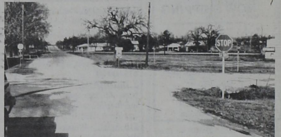
NEW FOUR WAY STOPS - On the Lexington and Kent Street crossing is now a Four Way Stop. The new signs were installed last week. Please watch for these new inovations around the school to help control traffic flow.