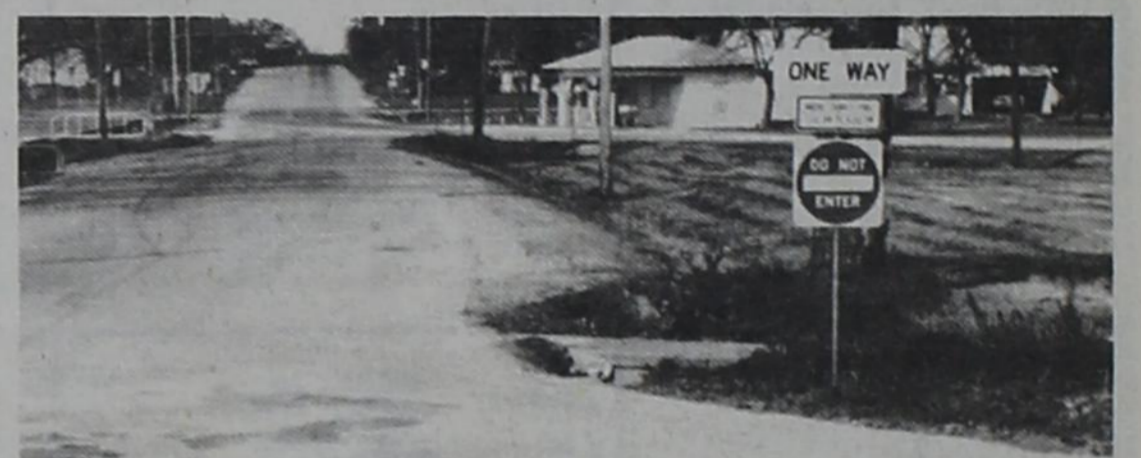
NEW ONE WAY ROAD - The above picture shows the placing of the signs on Lexington Street in front of the Grade School. The road is now One Way Only going East between the school hours of 7:00 a.m. to 4:00 p.m. Monday thru Friday. Please be aware of the new change in signs.

The Chamber invites you to make plans to attend the banquet and get your tickets early so we can get a good headcount for the caterer.