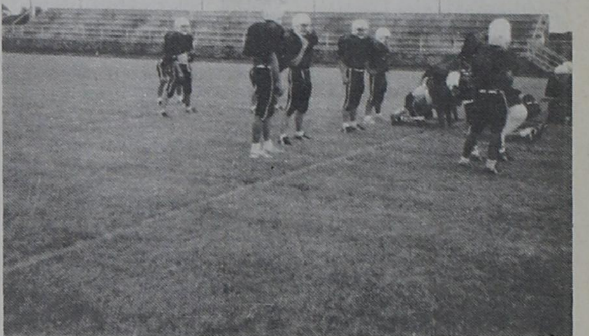
PANTHERS IN PRACTICE - The Panthers looked good in their two scrimmage games against Evant and Dublin. The above picture was taken during a practice one afternoon. The panthers hope to win against Perrin on Friday. GO BIG RED!!!