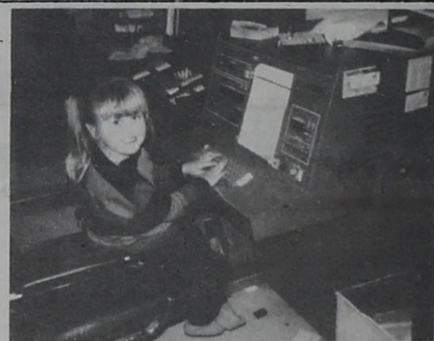
I Can Handle It - Pa Pa!!!

He is a 1976 graduate of Cisco High School, Cisco, Texas.