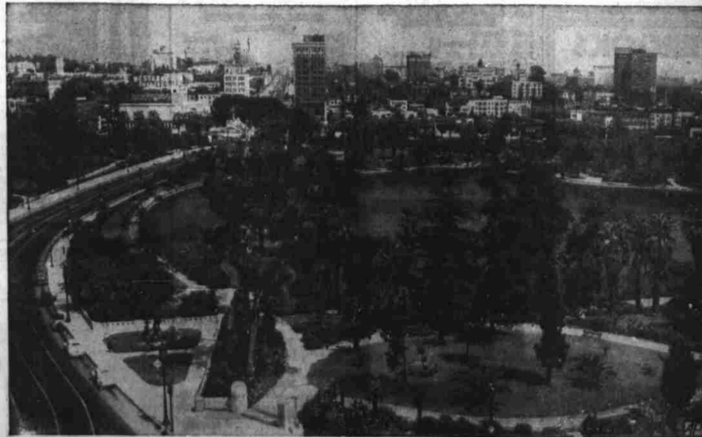
IT'S MACARTHUR PARK NOW —Westlake Park in Los Angeles, shown in this picture with some of the buildings of the business district in the background, has been renamed MacArthur Park, in honor of Gen. Douglas MacArthur.