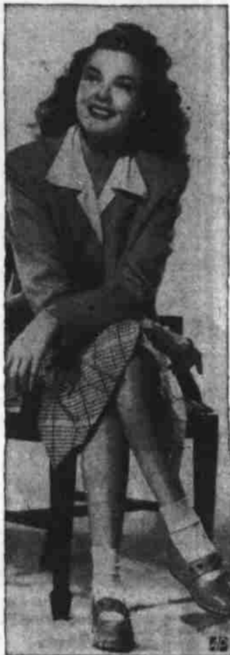
SOCKO —To help conserve glossier material for parachutes and other war needs, Marguerite Chapman, screen actress, leads a fad for cotton socks. "Sock the Japs with socks" is the slogan for the campaign in which she's taking part.