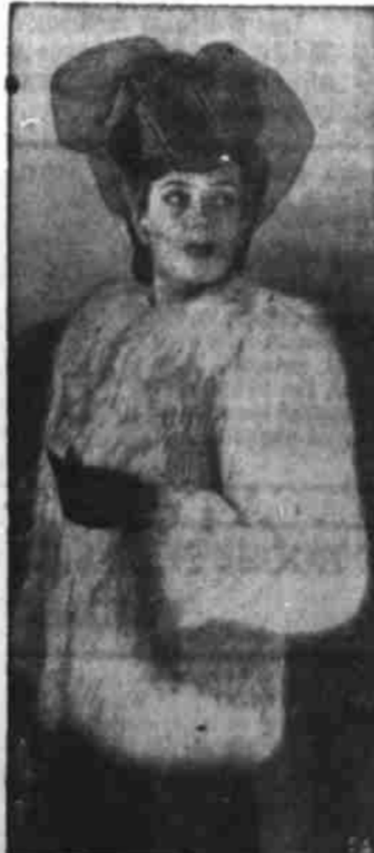
SUMMER JACKET —White-haired Russian lynx is used in this Dein-Hacher jacket for summer evening wear, designed in torso length with skins swirling at the bottom.