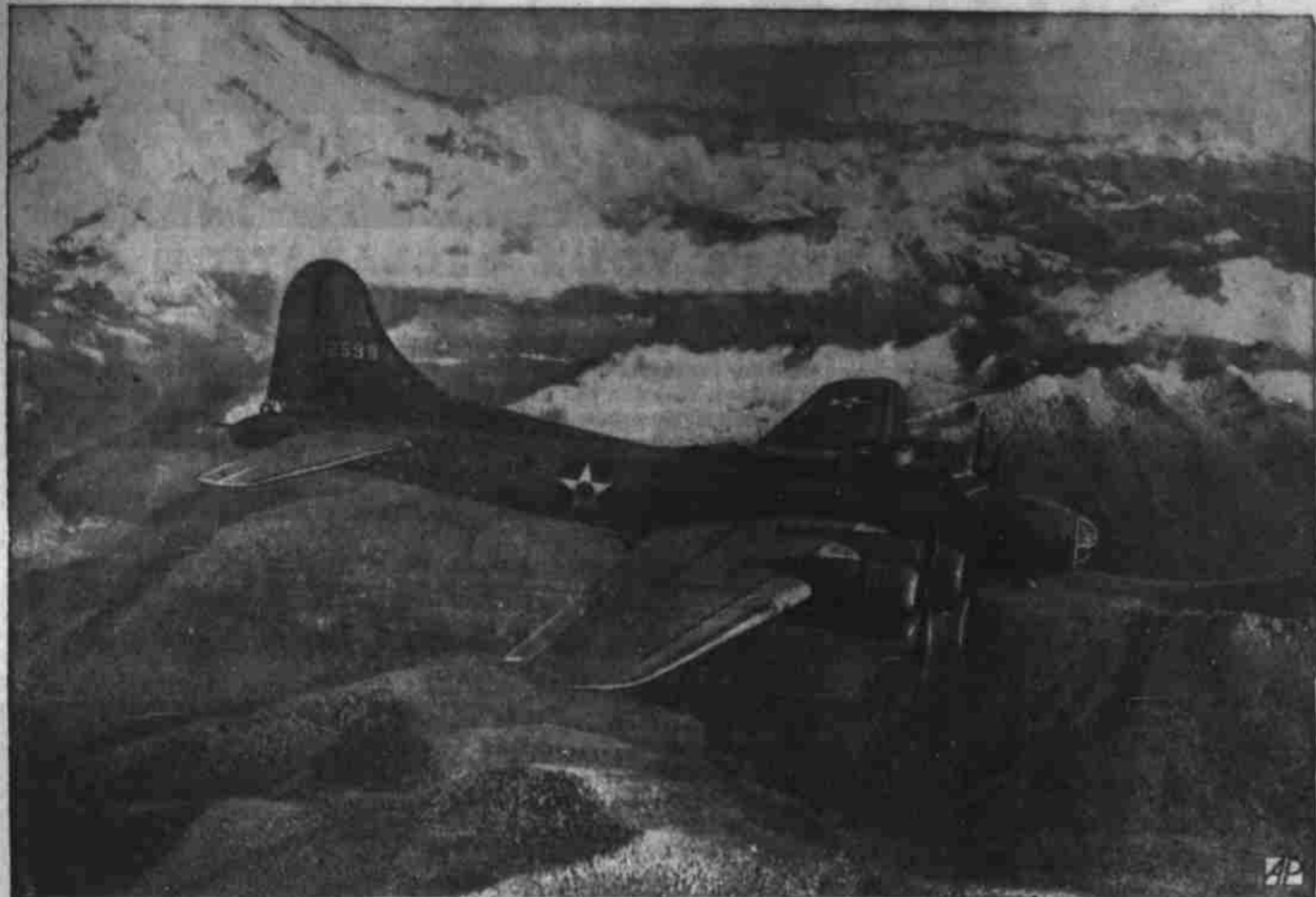
FLYING FORTRESS, NEW MODEL —High above a rugged stretch of landscape speeds this Boeing B-17E, described by the war department as "bigger and more deadly" than previous "flying fortress" models. Several U. S. plants now make the planes.