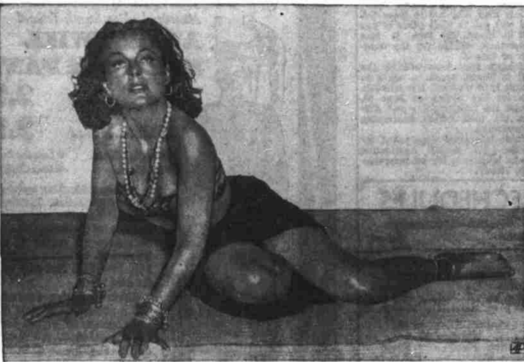
HEDY GOES NATIVE IN 'LURONG' —Hedy Lamarr, all set in exotic makeup for her Tondeloyo role in "White Cargo," wears a new kind of tropical costume called a "lurong." It's not exactly a sarong. It is explained, but is supposed to have lots of allure, as demonstrated by Miss Lamarr in this pose.