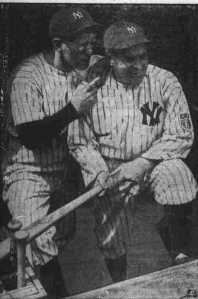
DUGOUT CONFERENCE —Joe McCarthy (right), manager of the world champion New York Yankees, seems tickled by what he hears from Kay Kyser, band leader and avid baseball fan. Kyser worked out with the Yankee squad before the game.