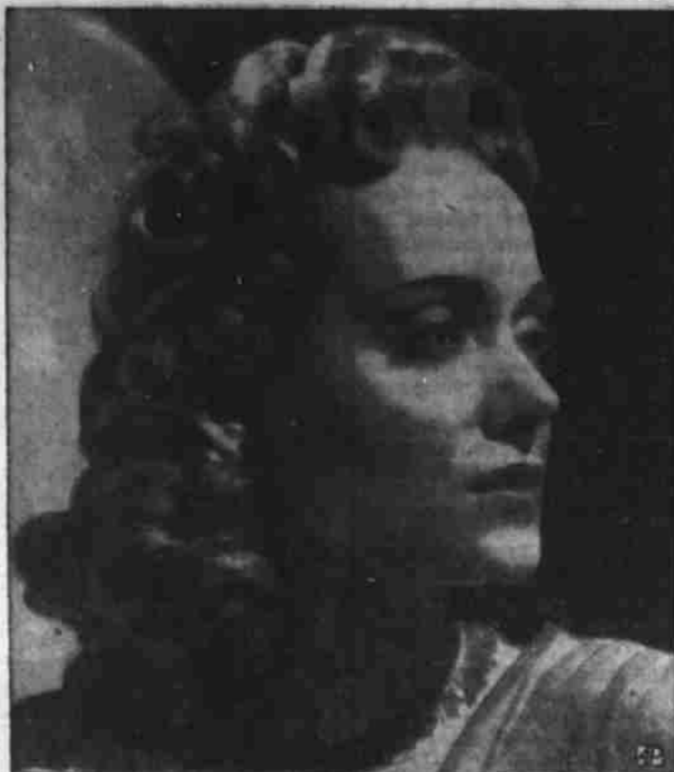
SWEETHEART —Martha Scott (above), stage and screen actress, was chosen U. S. marines' sweetheart.