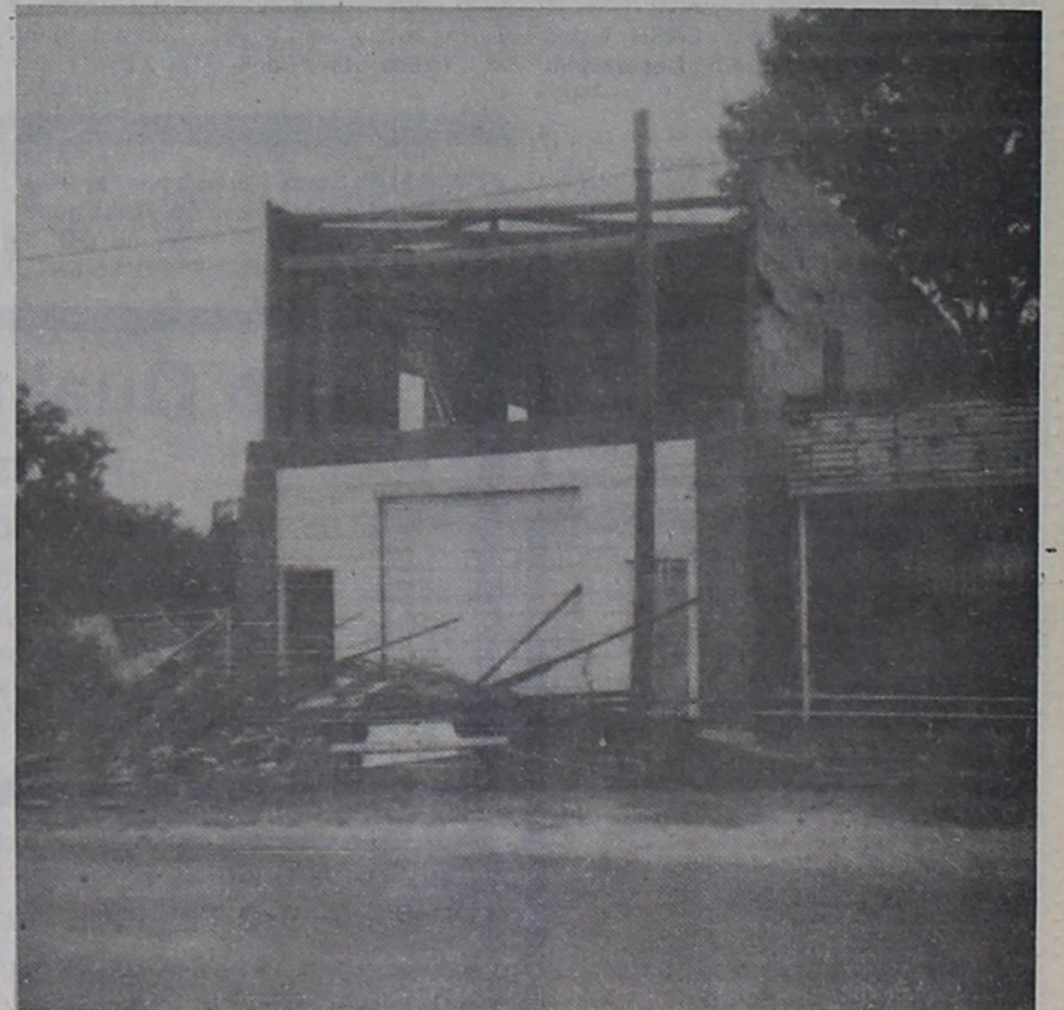
The building on the Corner of Smith Bros. Chevrolet lot is being demolished. The building has been around for a very long time. It is the former E. T. Jones Grocery Store, when many school children bought their candy and school supplies in the 30's.

We could not find out how old the building is or who built the building. If any one knows more about this building please contact the Gorman Progress.