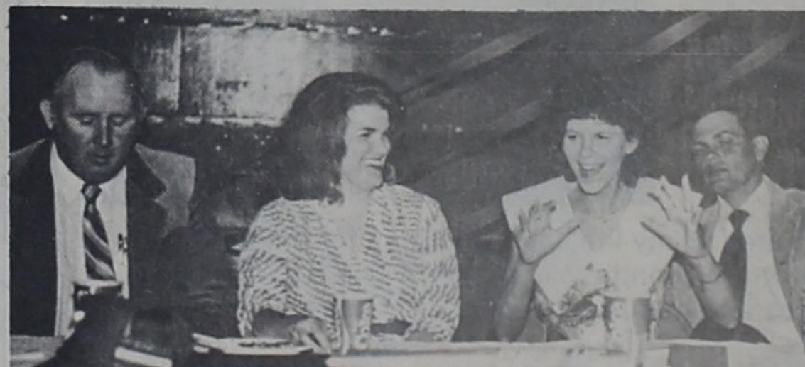
MEMBERS OF THE FACULTY