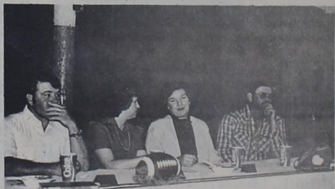
MEMBERS OF THE FACULTY

make their day with these graduation gifts