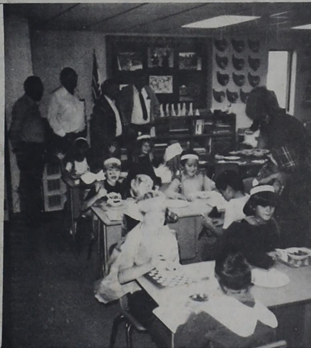
Continued Page 4