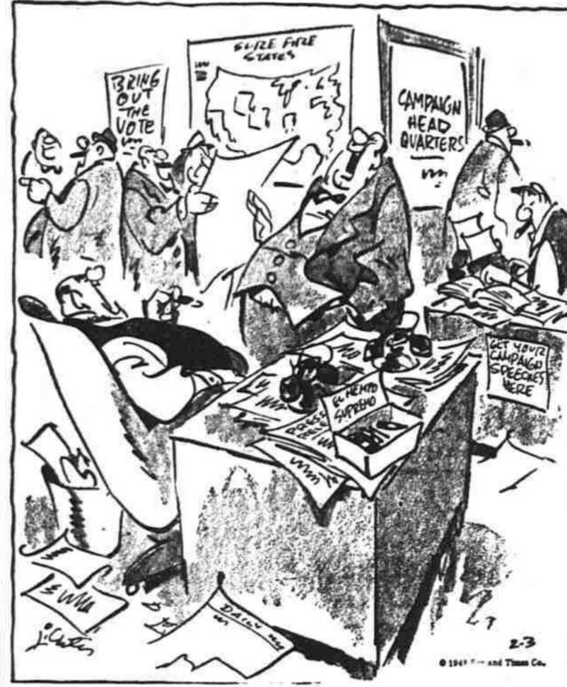
"We can't laugh off this 'third party' stuff - if they come out with a platform of new cars at factory list prices, we're sunk!"