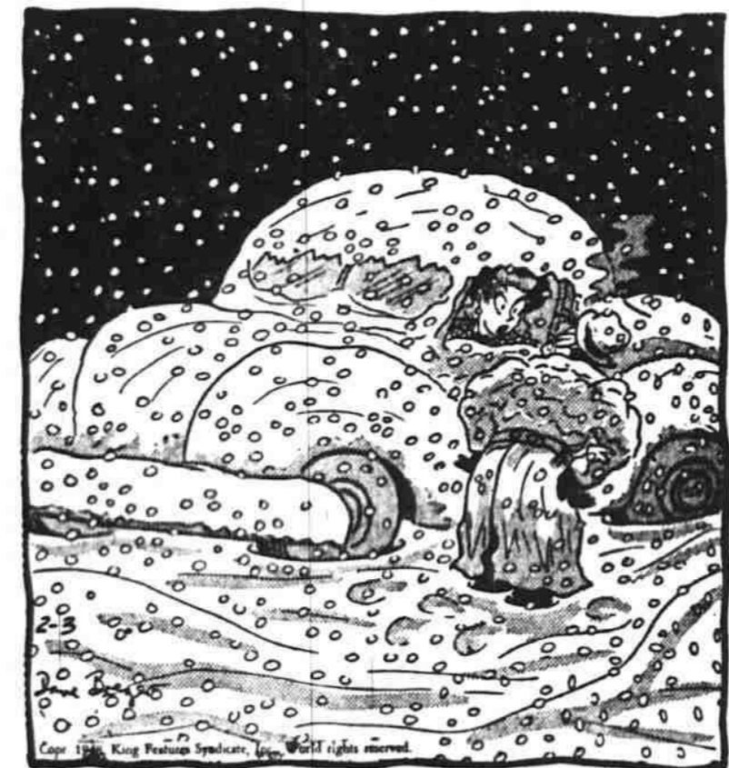
"THOUSANDS of people advertise for work, every day - and NOT ONE around to help dig us out..."