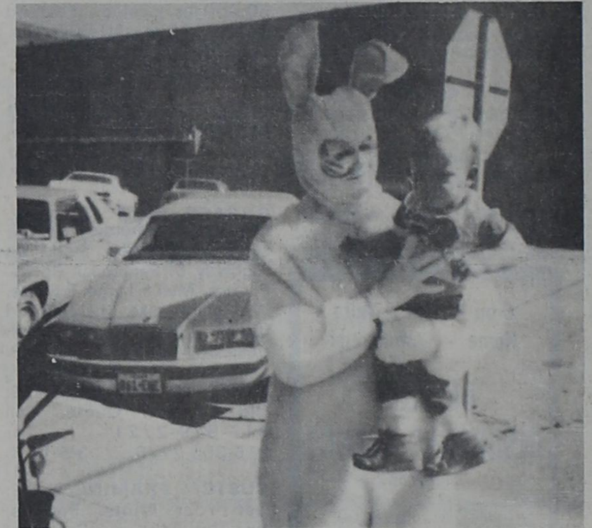
EASTER BUNNY WITH ONE OF THE YOUNGSTERS PRESENT