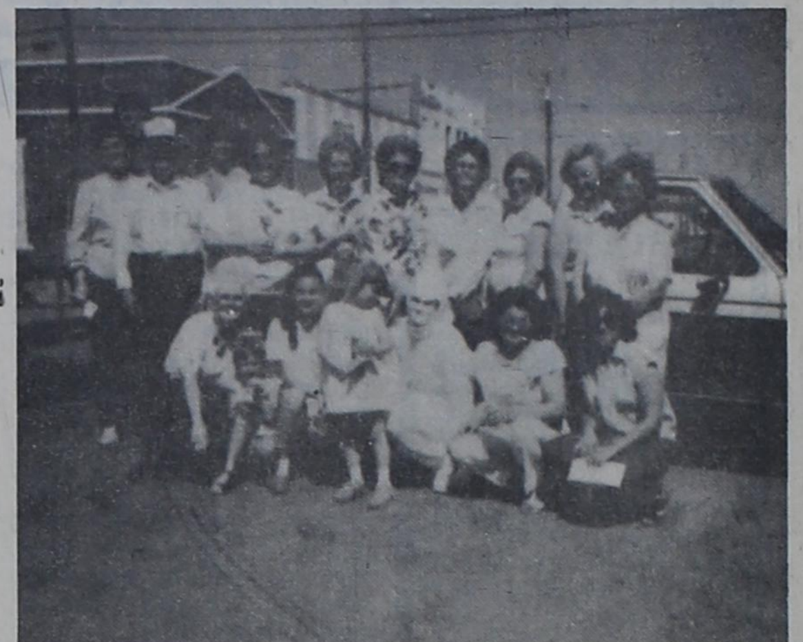
GROUP OF WINNERS IN THE DRAWINGS HELD SATURDAY