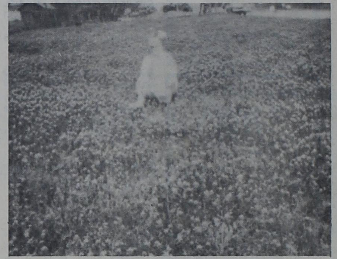
EASTER BUNNY AT HOME IN BLUE BONNETS