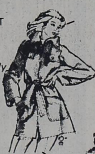
VINYL PANT COAT by Empire $19.50 ½ Sizes Only