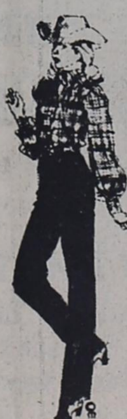
WRANGLER FOR LADIES