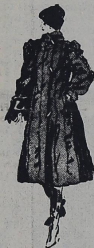
LADIES COATS BY EMPIRE $59.95 to $99.95