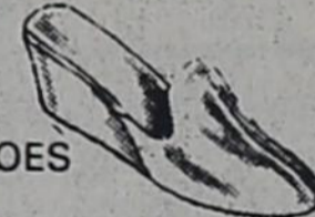
Ladies HOUSE SHOES $9.95