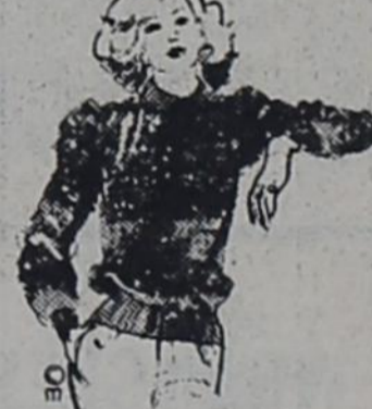
SWEATERS $12.95 to $46.95