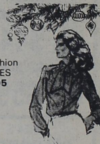
New Fashion BLOUSES $14.95