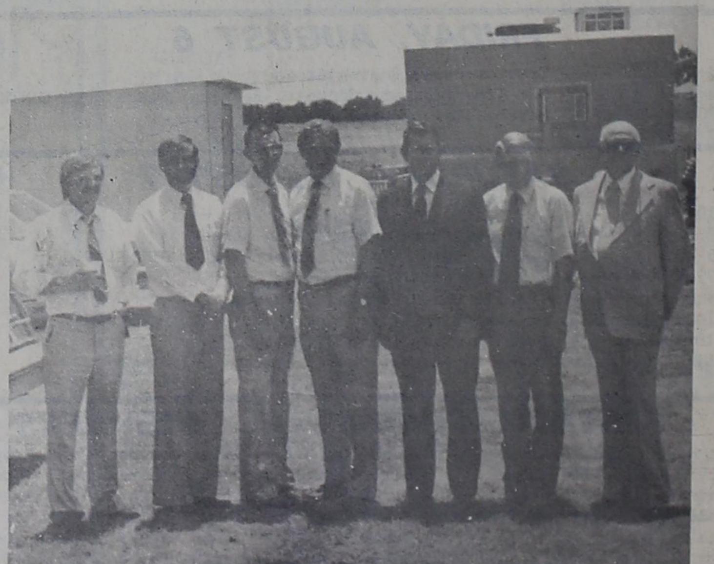
PAST PASTORS AT NEW HOPE BAPTIST CHURCH

In 1980 new windows, storm doors, and carpet was installed and in 1981 the ceiling fans were installed.