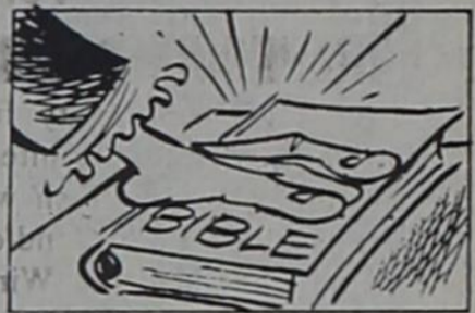
Thomas Jefferson was the first US president to be inaugurated in Washington, D.C.